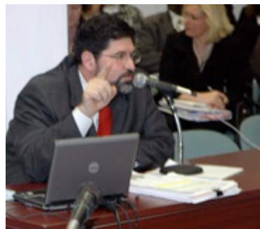
Baltimore City Schools CEO discussed the progress of the system in an appearance before the State Board this week.

The class of 2009 is well on its way to completing its high school graduation requirements, according to data presented this week to the Maryland State Board of Education.